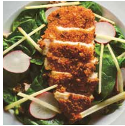
Pecan Crusted Chicken Salad