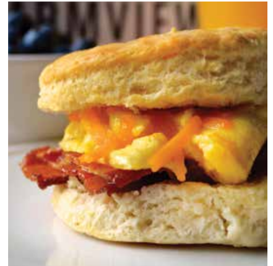
Bacon, Egg & Cheese Biscuit