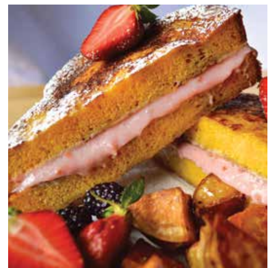
Farmview French Toast