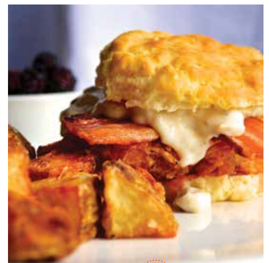
The Rooster Biscuit